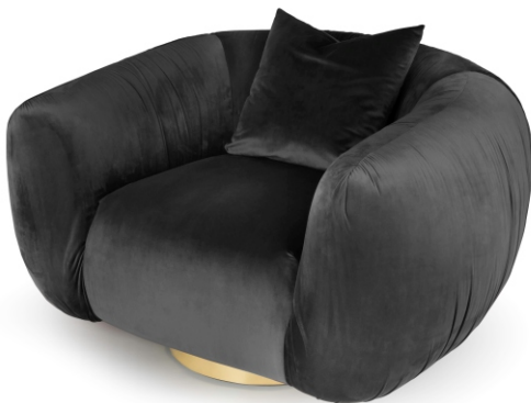
BELLY armchair by Bessa Design . This piece will be featured at Maison et Objet Paris 2019.