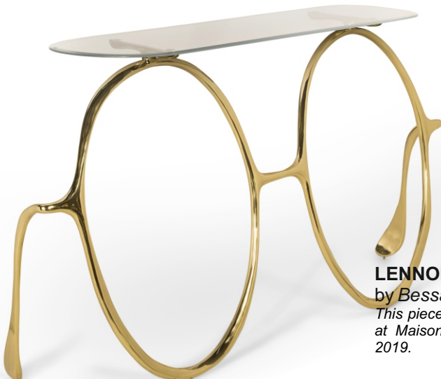
LENNON console by Bessa Design . This piece will be featured at Maison et Objet Paris 2019.