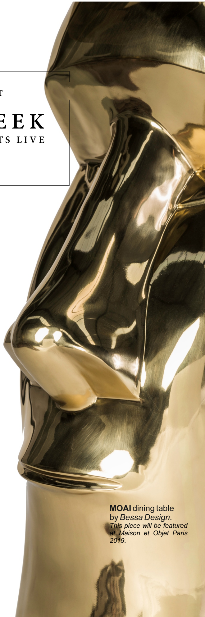
MOAI dining table by Bessa Design . This piece will be featured at Maison et Objet Paris 2019.