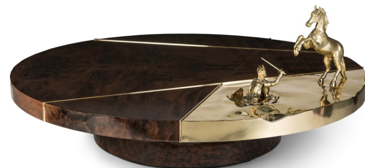
CHESS center table by Bessa Design . This piece will be featured at Maison et Objet Paris 2019.