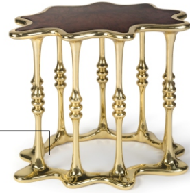
GAUDI side table by Bessa Design . This piece will be featured at Maison et Objet Paris 2019.