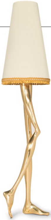
MONROE floor lamp by Bessa Design . This piece will be featured at Maison et Objet Paris 2019.