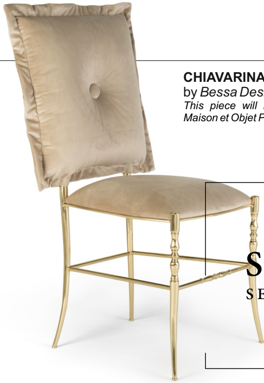
CHIAVARINA dining chair by Bessa Design . This piece will be featured at Maison et Objet Paris 2019.